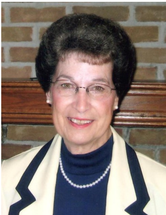
Funeral Mass For