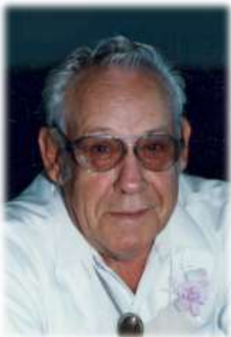
The Twenty-Third Psalm

The Lord is my shepherd, I shall not want. He maketh me to lie down in green pastures: He leadeth me beside the still waters. He restoreth my soul: He leadeth me in the paths of righteousness for His name's sake. Yea, though I walk through the valley of the shadow of death, I will fear no evil: for thou art with me; Thy rod and thy staff they comfort me. Thou preparest a table before me in the presence of mine enemies: thou anointest my head with oil; my cup runneth over. Surely goodness and mercy shall follow me all the days of my life: and I will dwell in the house of the Lord forever.