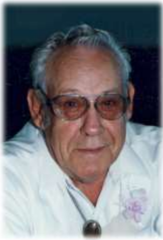
The Twenty-Third Psalm

The Lord is my shepherd, I shall not want. He maketh me to lie down in green pastures: He leadeth me beside the still waters. He restoreth my soul: He leadeth me in the paths of righteousness for His name's sake. Yea, though I walk through the valley of the shadow of death, I will fear no evil: for thou art with me; Thy rod and thy staff they comfort me. Thou preparest a table before me in the presence of mine enemies: thou anointest my head with oil; my cup runneth over. Surely goodness and mercy shall follow me all the days of my life: and I will dwell in the house of the Lord forever.