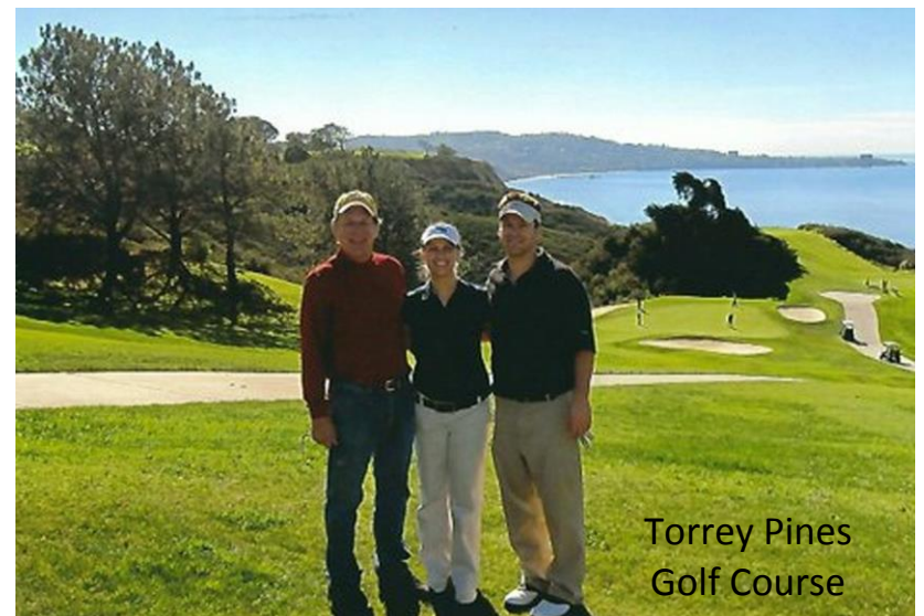
Torrey Pines Golf Course